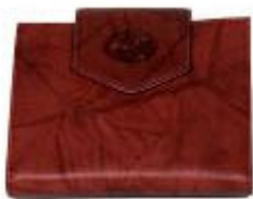
Part ID: 575 Colors: Black, Red, Mahogany, Navy