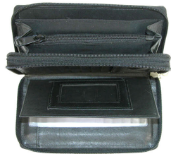
$99.00 with Portrait