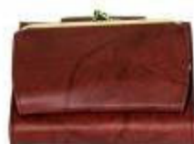
$89.00 with Portrait