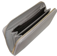
$99.00 with Portrait