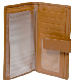
$79.00 with Portrait