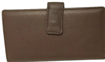
Part ID: 574 Colors: Tan, Dark Brown