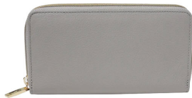
Part ID: 573 Colors: Black, Gray, Red