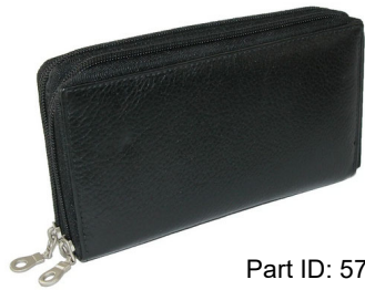
Part ID: 572 Colors: Black, Dark Brown